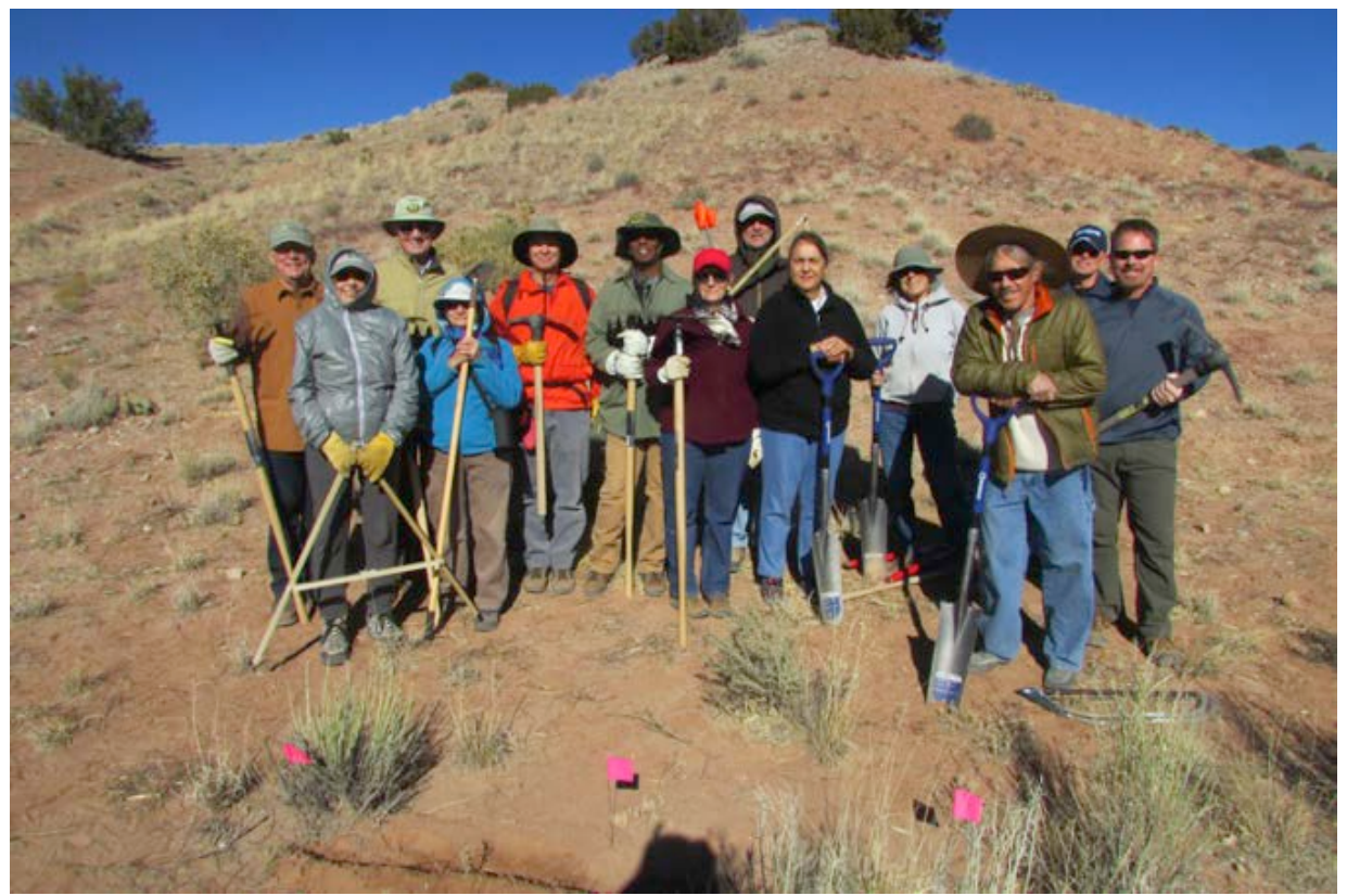
m. The team of volunteers for erosion control work, December 2015 – April 2016.

We also asked for their opinion about improvements in management we should consider in similar future projects. Some said they would have liked to have a better idea of just what we wanted to accomplish in the time frame. They wanted some indication that they had "completed" what was expected. The other aspect most likely to be mentioned in discussions with them revolved around what is the appropriate amount of direction and oversight for a group of motivated adult volunteers. Some said they liked the generally loose organization of the work for each session, so they could pick and choose what they wanted to do that day. Others said they felt at a loss for just what they should be doing at a particular session and would have liked more specific direction for what was going to happen in that session. Certainly, it is the responsibility of the project management team to detect these preferences and try to ensure that individual volunteers get what they need in order to have a positive—and long term—experience.