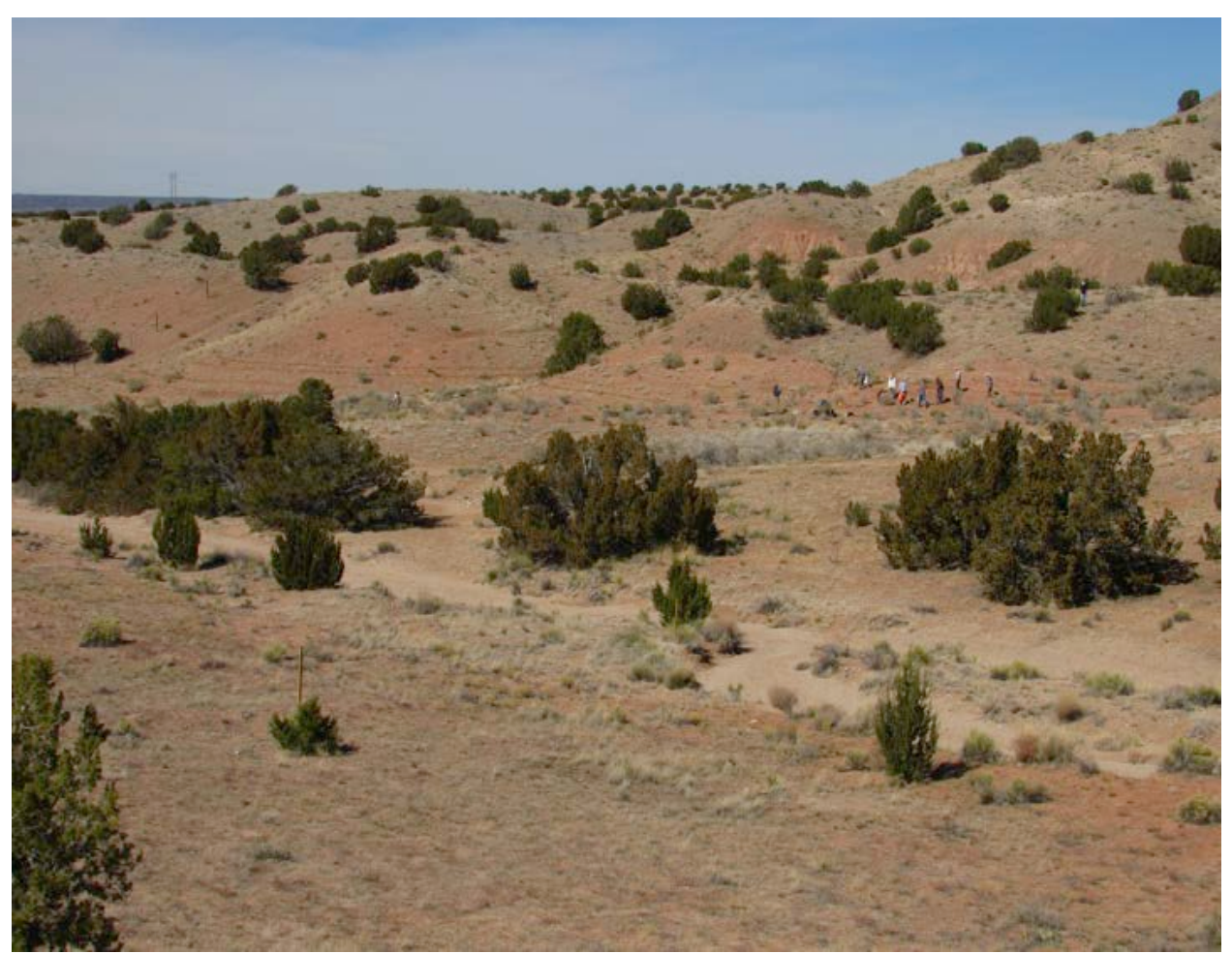
View of project work team on third of four areas of the POS receiving permaculture treatment

Project Period: July 2015 through June 2016 Coronado Soil and Water Conservation District