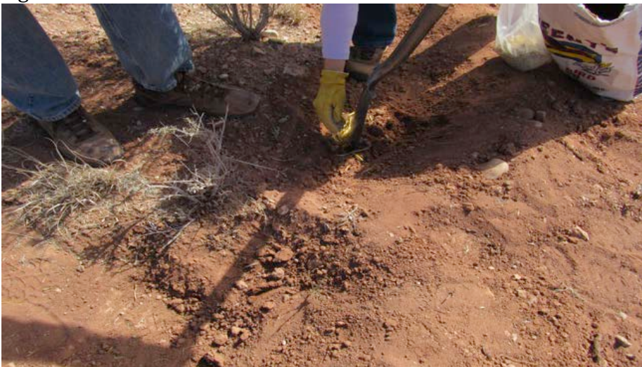
e. Placing straw and grass seed in a pocket made with the sharp shooter shovel.

<u>Sponge Pockets.</u> About every 12 to 18 inches in the swale a narrow shovel was inserted about eight inches into the ground and levered to the side to create a pocket in the soil. Seen here is a sharp shooter shovel. Some mulch—in our case, straw—was put into this pocket and a handful of native grass seed sprinkled in it and along the swale, and a bit of soil sprinkled back over the pocket. It is better to use as the mulch something that rabbits aren't likely to eat. Moisture retained by the sponge pocket can facilitate the germination of the natural grass seed.