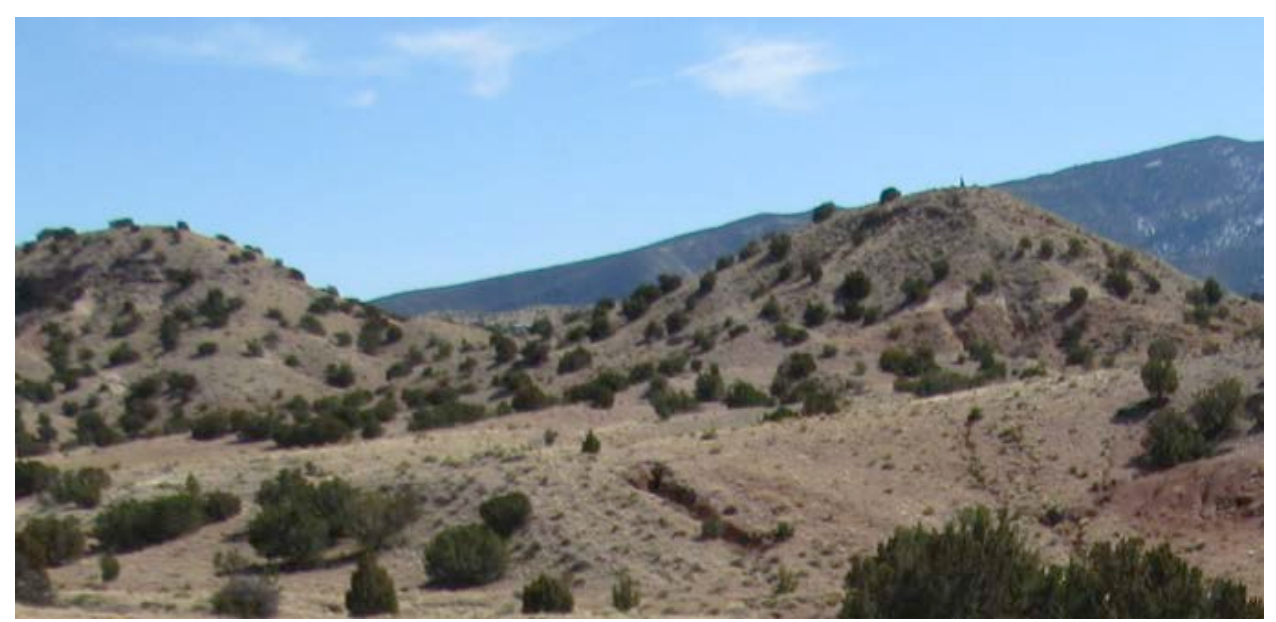
a. POS slope damaged with serious head cut and channel, opposite work site.

Occasional extreme precipitation, gusting winds, drought and free roaming horses in recent years lend to the degradation of vegetation and soils. The recent ongoing drought prevents natural vegetation from recovering in an annual cycle, leaving the soils vulnerable to continuing damage. With increased run-off, flooding results in damage to residential areas to the west (Algodones) and south (Placitas subdivisions). The POS represents an area well suited to demonstrating how simple permaculture methods can be used to slow and capture run-off sheeting from hillsides that might otherwise result in erosion that is difficult to mitigate.