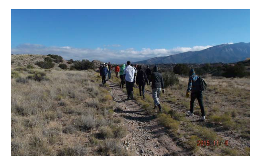
i. A 15 minute walk takes the volunteers to the POS border and worksite.

<u>Work Session Design and Schedule.</u> We asked potential volunteers about a preferred schedule for the work sessions. Using this, we designed the work sessions to be scheduled for twice a month, or approximately every two weeks. Given that the work was being done during the winter months, we scheduled it for mid-day for the probability of the warmest hours and most sunshine. By observing how the volunteers responded to the work we found that the work sessions were generally about two hours. This varied to some extent, depending on the weather or coming to a good stopping point. In order to curtail the use of several cars on the small dirt roads in the area, to get to the work site within the POS boundary, volunteers were asked to park in an area for this purpose at the edge of the BLM land to the west of the POS. They then walked about 15 minutes both to and from the work site, usually as a group. To keep this from being too much of a chore, the rather large and heavy array of tools was transported to the edge of the work site by car, by the project leader.