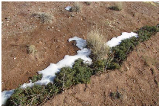
k. Early January, 2016, POS work site berm holding snow.