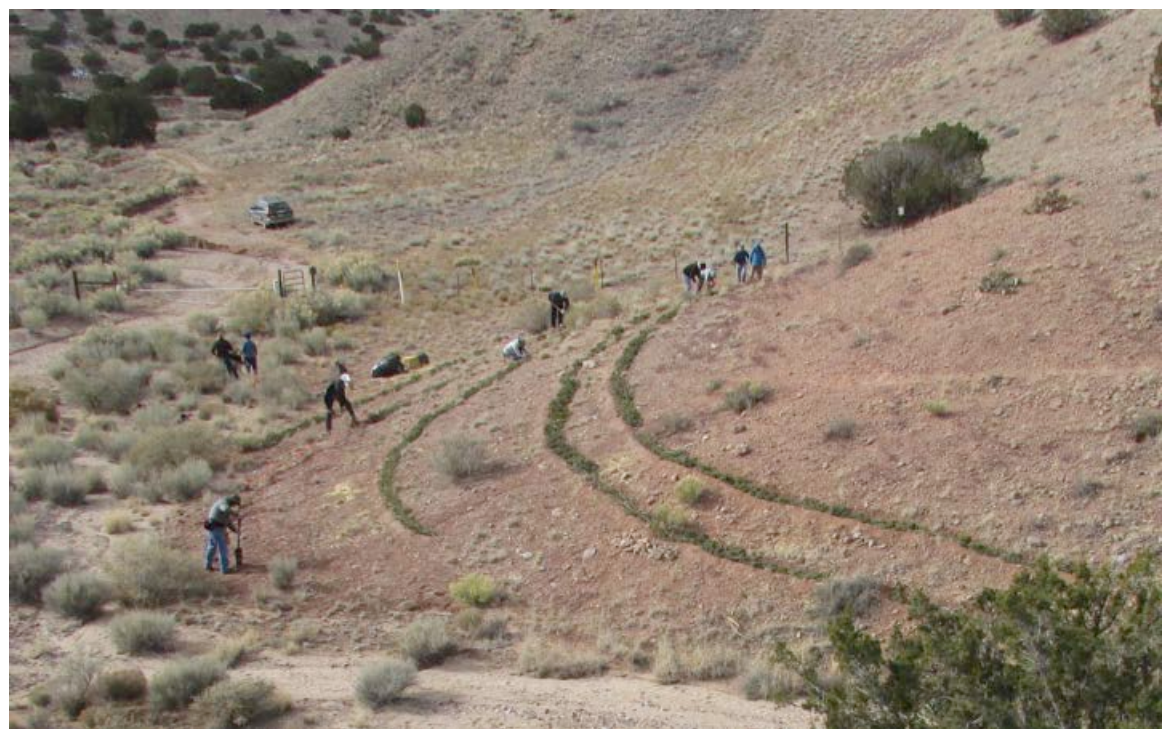
g. First series of berms in progress on first slope treated in the project.

A series of parallel berms is intended to capture snow or slow and capture run-off from the top and sides of the slopes. Berms were not put in the steeper areas of the slopes where they are more likely to just wash out. In this way, the project succeeded in placing multiple berms on four slopes, thus constituting an erosion control treatment for a large area, including the slope area above where the berms have been placed, and between the berms. These are expected to slow runoff, capture and infuse water into the soil, encourage the growth and proliferation of natural vegetation, and reduce the amount of sediment washing off the hillsides into the drainage gullies that have gradually been gouged out by fast moving runoff.